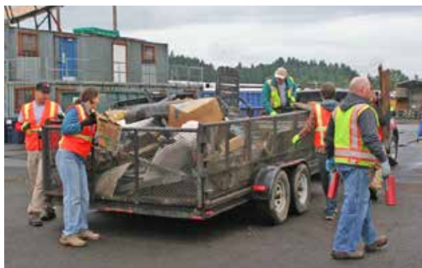
Recycle large and hard-to-recycle items at Spring Clean Up.

City leaders are committed to using Spring Clean Up as a way to say 'thank you' to residents by giving back at this annual event. It is an opportunity to recycle large items and hard-to-recycle materials in one