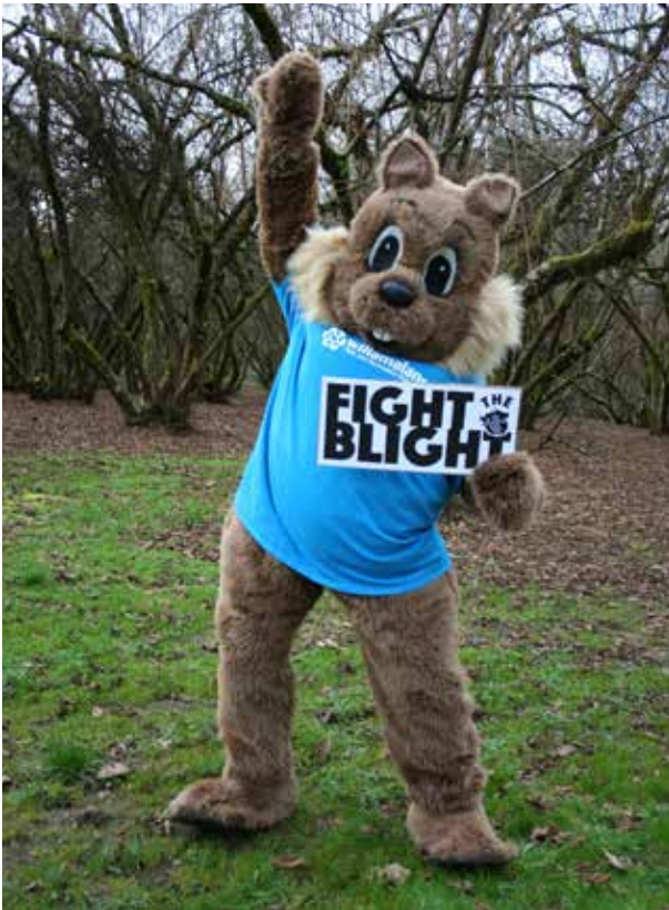
Spirings the Squirrel, Willamalane's mascot, wants you to FIGHT the BLIGHT.