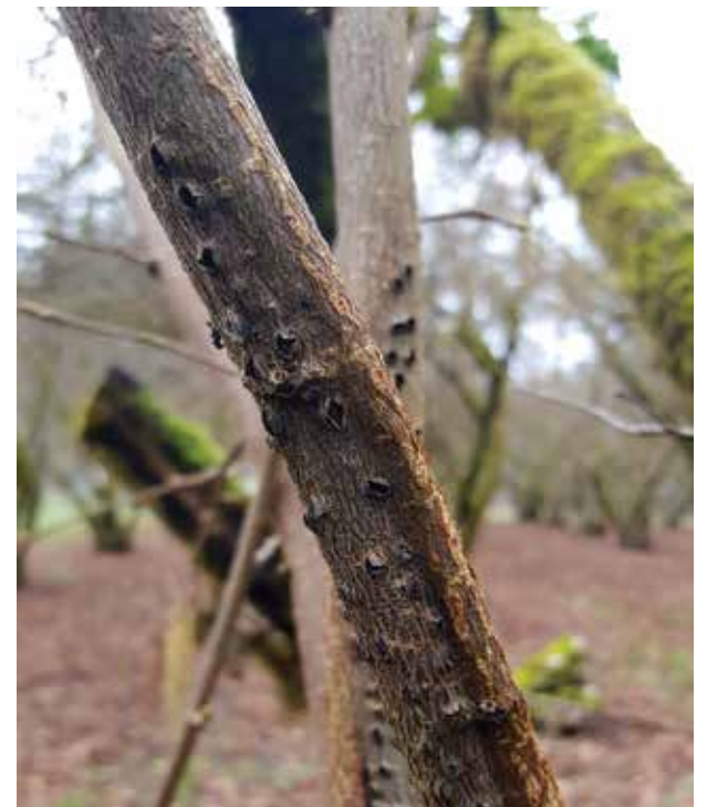
Raised sores appear on limbs infected by eastern filbert blight, and trees die within eight years.

While most of the filbert trees at Dorris Ranch will be replaced over the next 18 years, Willamalane plans to preserve four acres of historic 'Barcelona' trees in the Road Orchard, near the barn, where George Dorris' legacy will live on. Maintenance in the Road Orchard will include the use of anti-fungal sprays and selective removal of branches from blight-infested trees.