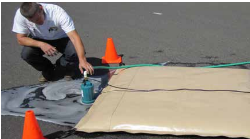
The City of Springfield has free Fish-Friendly Car Wash kits available to use to help protect local waterways by keeping the soapy, dirty water from entering the storm drain system.

Planning a fundraiser? The City of Springfield has Fish-Friendly Car Wash kits available to use for free that help protect local waterways by keeping the soapy, dirty water from entering the storm drain system. Email WaterResources@springfield-or.gov to reserve a kit or visit www.springfieldstreams.org for more information. Springfield staff will show you how to set up and use the kits before your next car wash or car wash fundraiser. Reserve a kit and do your part to help keep local rivers clean and healthy!