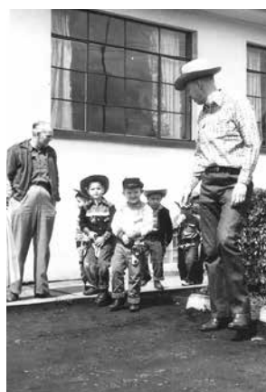
Exhibit: Aug. 12-Sept. 30, Opening reception: Friday, Aug. 12, 5-8 p.m., during the Second Friday Artwalk Museum hours: Tuesday-Thursday, 11 a.m.-4 p.m., Friday, 11 a.m.-6 p.m., Saturday, 10 a.m.-4 p.m.

Willamalane exhibit at Springfield Museum 590 Main St.